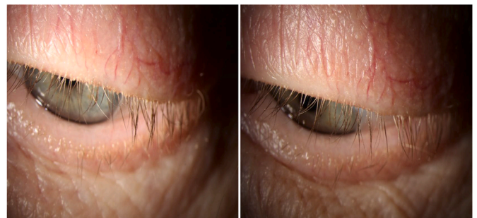
Fig. 3. Patient 1, left eye, with dense sleeves on day of treatment, prior to application of topical ivermectin 1% cream (left), and the same eye two weeks later (right).