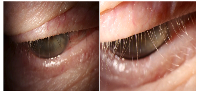
Fig. 10. Patient 5, right upper eyelid with dense sleeves on the day of treatment, prior to application of topical ivermectin 1% cream (left), and three weeks later, a higher magnification image, showing resolution of sleeves (right).