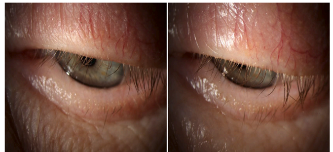
Fig. 4. Patient 1, two months after application of topical ivermectin 1% cream, showing complete resolution of sleeves (left), and eight months after treatment showing some recurrence of sleeves (right).

with ocular irritation and was prescribed a regimen of lid scrubs using a baby shampoo. In 2011, the patient presented again with ocular irritation, and nightly topical azithromycin was prescribed. In December 2014, nightly lid scrubs with Ocusoft® pads were added to his routine. He became intolerant to azithromycin (stinging) and discontinued it. In March 2015, he was treated with a physician-applied swab stick containing 50% tea tree oil. Overnight he developed severe swelling of the eyelids which was treated with topical dexamethasone and a 5-day pack of oral methylprednisolone. The swelling resolved over the course of a week. When he returned in 2016, his blepharitis was treated with a regimen of Oust™ Demodex® pads in the morning and at bedtime. Follow-up 5 months later revealed persistent eyelid irritation. Baby shampoo lid scrubs were restarted. In March 2017, the patient presented