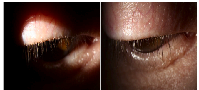
Fig. 6. The right upper eyelid of patient 3, with moderately dense sleeves, on the day of treatment with ivermectin 1% cream (left), and three weeks later showing near-complete resolution (right).