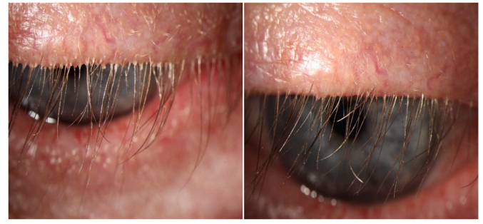
Fig. 9. Patient 4, left upper lid on the day of treatment, showing dense sleeves, prior to application of ivermectin 1% cream (left), and two weeks later, a higher magnification view, showing near-complete resolution (right).