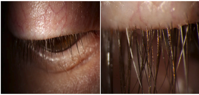
Fig. 7. Patient 3, right upper eyelid, two months after treatment with ivermectin 1% cream, showing resolution of sleeves (left), and a high magnification image of the same eyelid (right).

omega-3 (DE 3 Dry Eye Omega Benefits®, Physician Recommended Nutraceuticals, Blue Bell, PA, USA) in July 2019. During his tenure, he always had moderately dense sleeves in both eyes, which had not been specifically treated. The presence of Demodex was confirmed by direct visualization of the mites (Fig. 8). In January 2020, he was treated with physician-applied topical ivermectin 1% cream, and asked to scrub his lids with a hot, wet washcloth at bedtime. He returned for follow-up two weeks later, and was found to have a dramatic reduction in his sleeves (Fig. 9). Most importantly, his chronic ocular symptoms resolved. When he returned for follow-up in July 2020, he was noted to have mild sleeves.