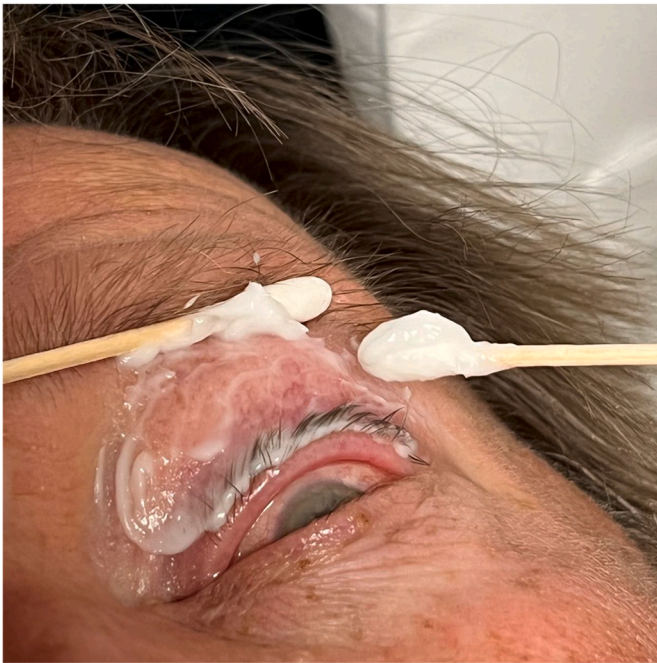
Fig. 1. Method of application of ivermectin cream. The cream is applied to the base of the eyelashes while trying to avoid the eyelid margin in order to keep it out of the eye.