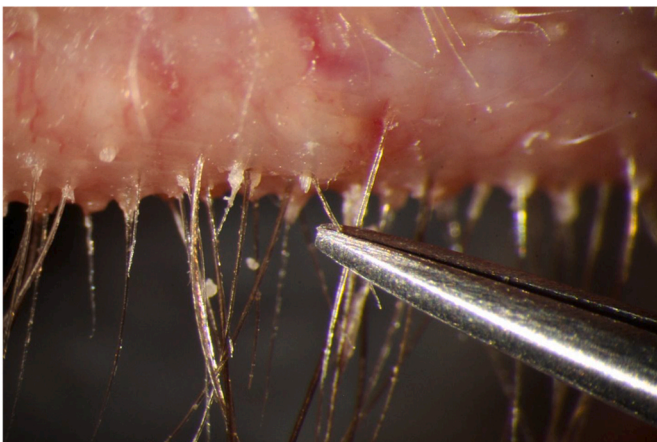
Fig. 8. Patient 4, left upper eyelid, with protruding “tails” (opisthosomata) at the base of the eyelash being grasped by the forceps.

Patient 5 was a 70-year-old diabetic man with a history of rosacea and chronic blepharitis, who presented with bilateral ocular irritation. Slit lamp examination revealed moderately dense sleeves bilaterally involving the upper eyelids. Demodex infestation was confirmed by extracting a mite under slit lamp visualization. In December 2019, the patient was treated with topical ivermectin 1% cream in the office. Three weeks later, he was found to have near-complete resolution of the sleeves and resolution of his ocular symptoms. (Fig. 10). No other treatment, such as lid scrubs, was used after treatment with ivermectin cream. At follow-up visits in March and June 2020, no recurrence of sleeves was noted. On examination in May 2021, he was found to have mild recurrent sleeves, but a treatment effect was clearly apparent 16 months later.