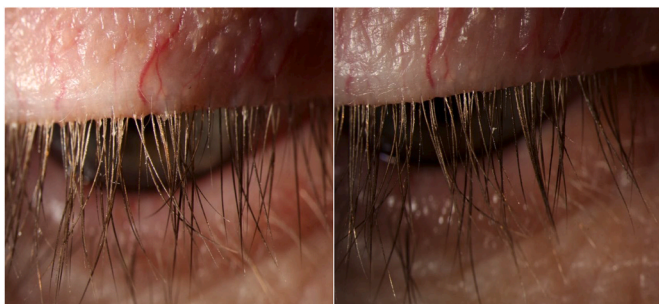
Fig. 5. The right upper lid of patient 2, on day of treatment with ivermectin 1% cream, showing moderately dense sleeves (left), and 3 weeks after treatment, showing nearly complete resolution of sleeves (right).