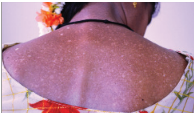
Figure 1: Multiple hypopigmented and depigmented macules over upper back with few atrophic lesions on left shoulder